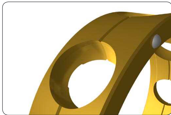
Detailed view of the newly redesigned M-cage pocket

For additional information, contact the SKF application engineering service.