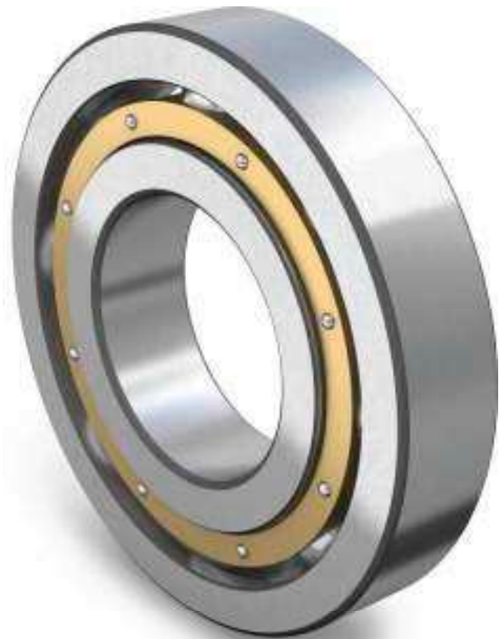
SKF deep groove ball bearing equipped with new brass M-cage