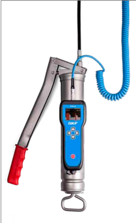
Fig. 1 – SKF TLGU 10 on a grease gun

The SKF Ultrasonic Lubrication Checker TLGU 10 is designed to help improving relubrication practices, based on machinery condition.