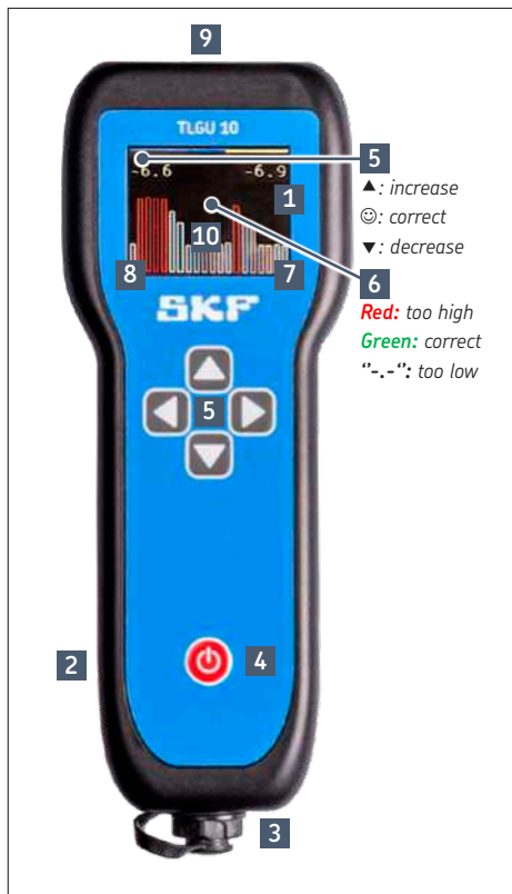
Fig. 2 – General aspect

Open the battery compartment with a screwdriver. Correctly insert (+/-) two AA alkaline or rechargeable batteries. The remaining battery level is displayed here (1).